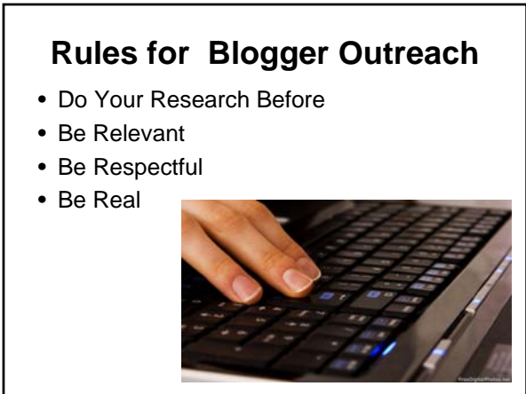
Having a mutualistic symbiotic relationship...sort of!